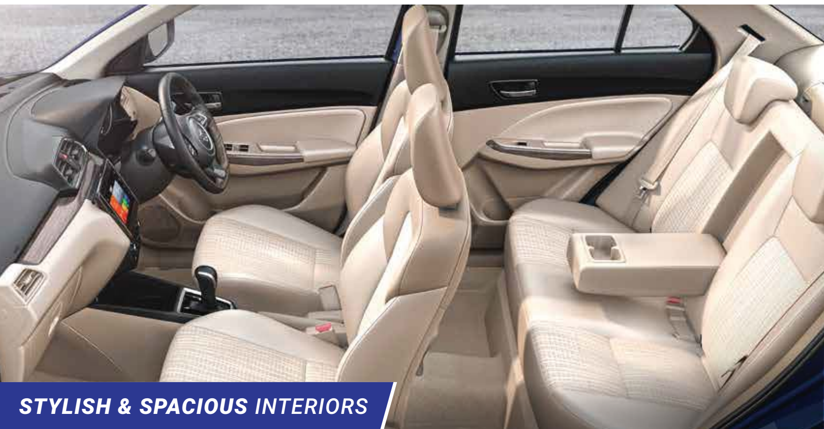
STYLISH & SPACIOUS INTERIORS