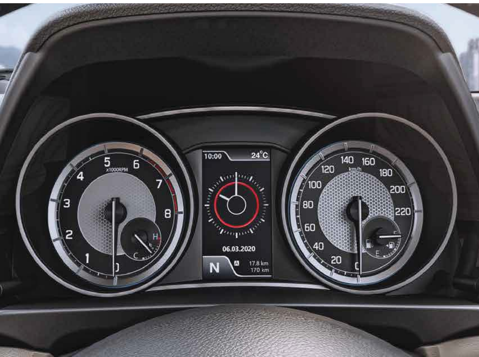
COLOURED MULTI-INFORMATION DISPLAY (10.67cm)