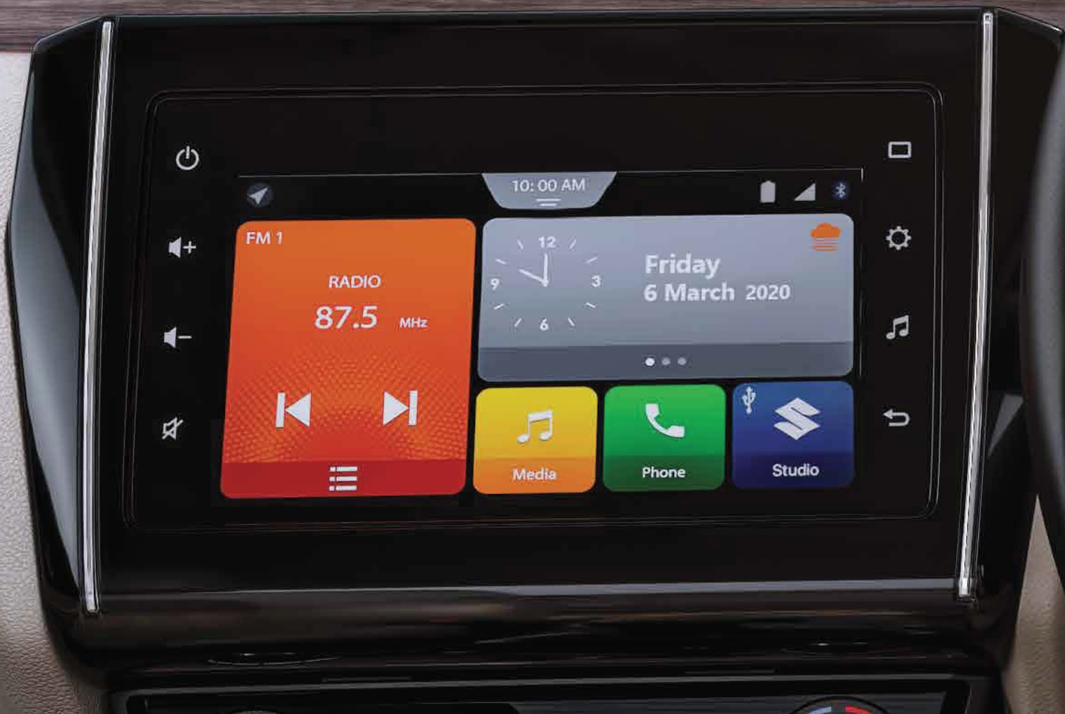
SMARTPLAY STUDIO SYSTEM (17.78cm)