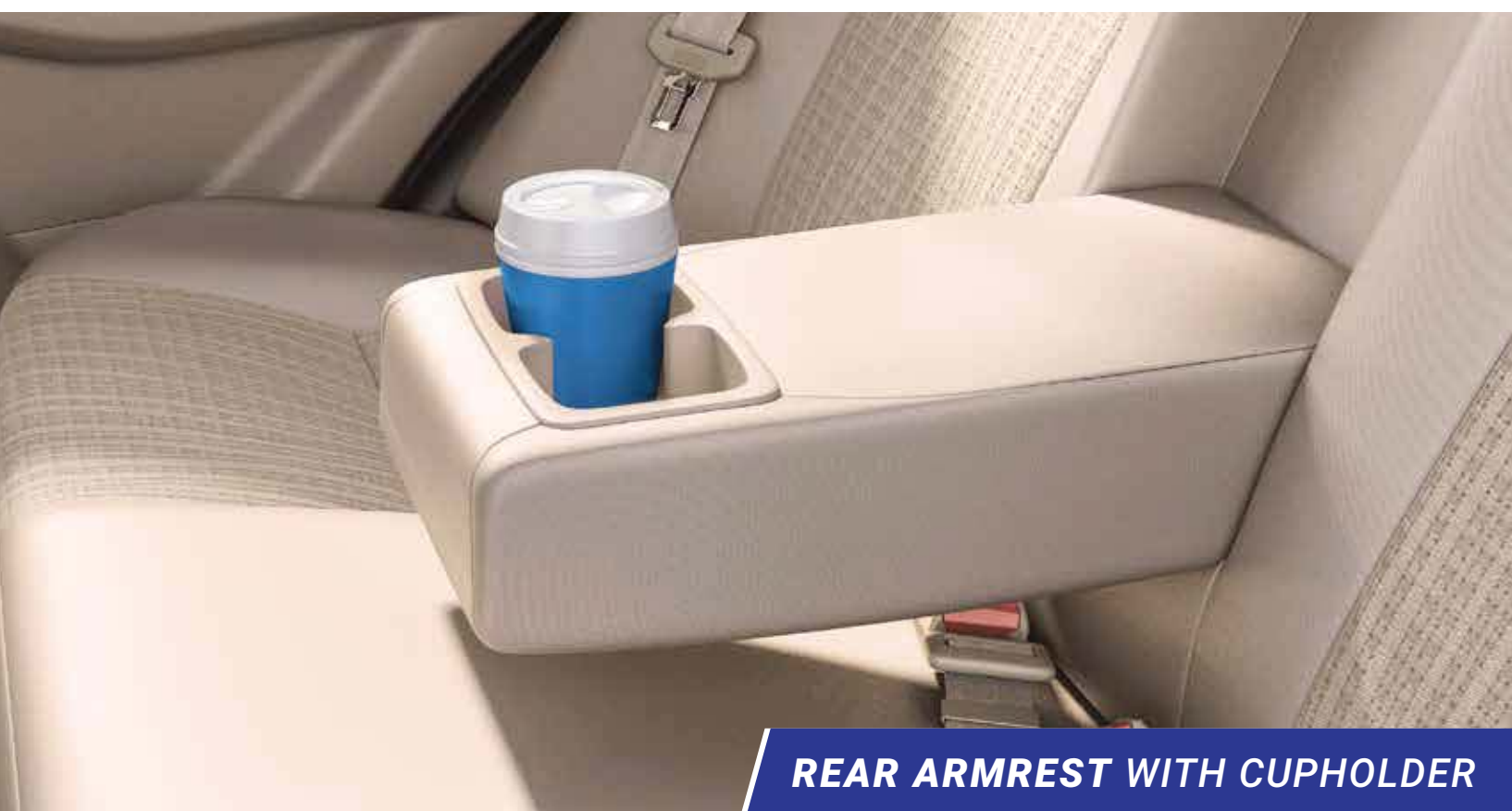
REAR ARMREST WITH CUPHOLDER