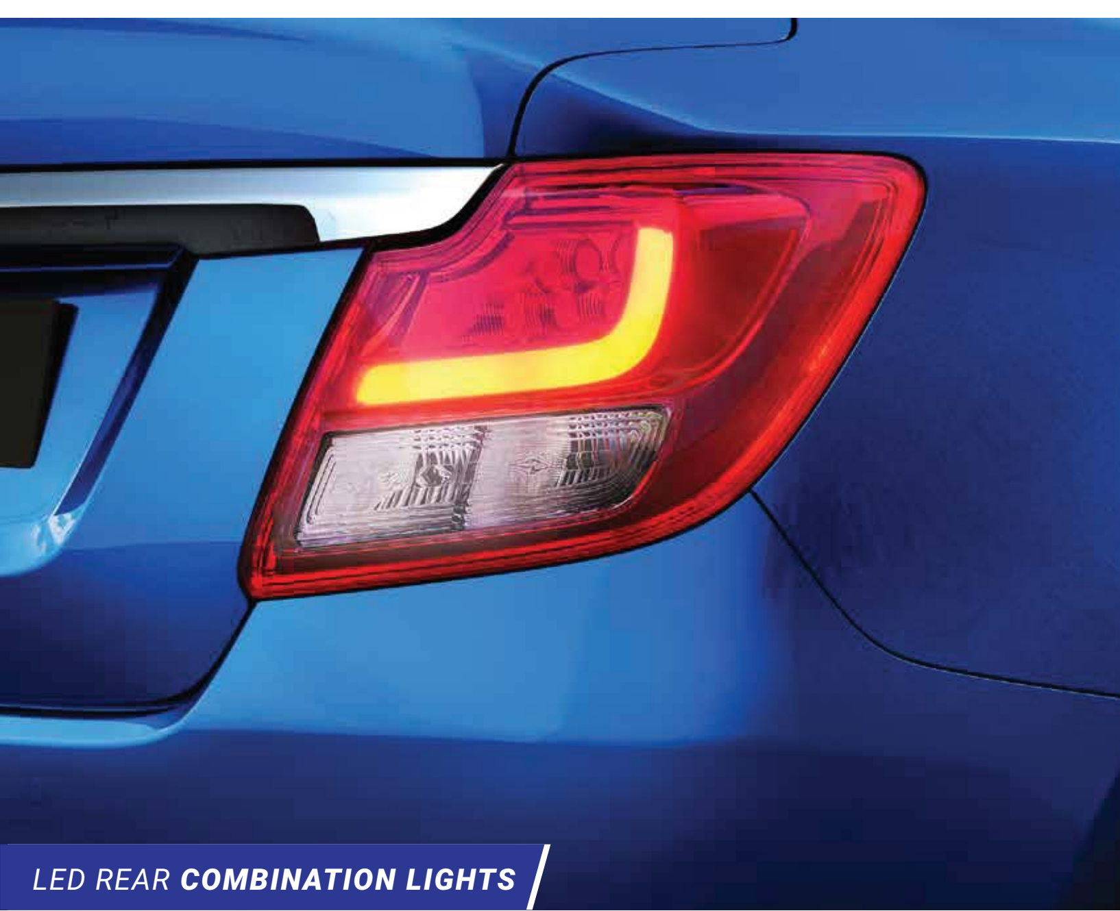
LED REAR COMBINATION LIGHTS