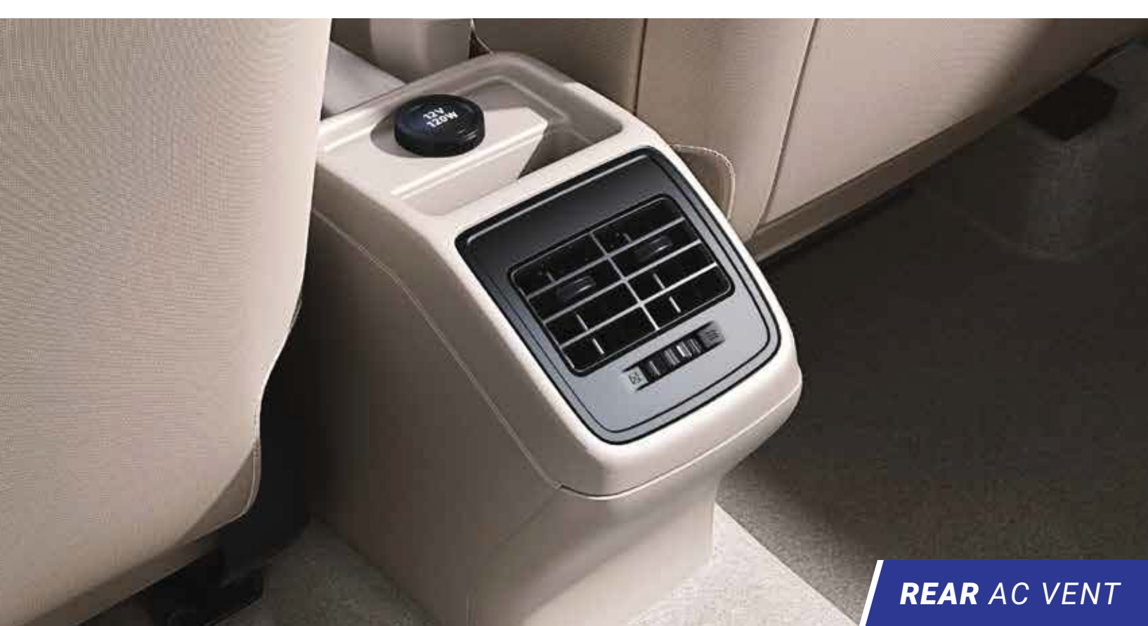
REAR AC VENT