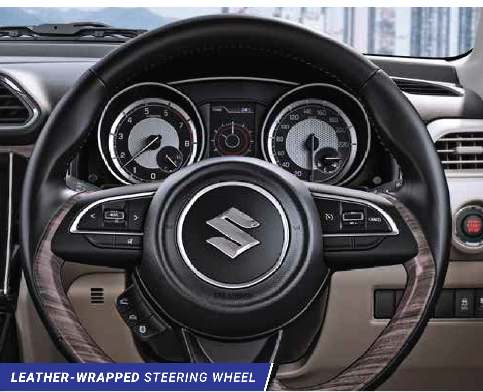
LEATHER-WRAPPED STEERING WHEEL