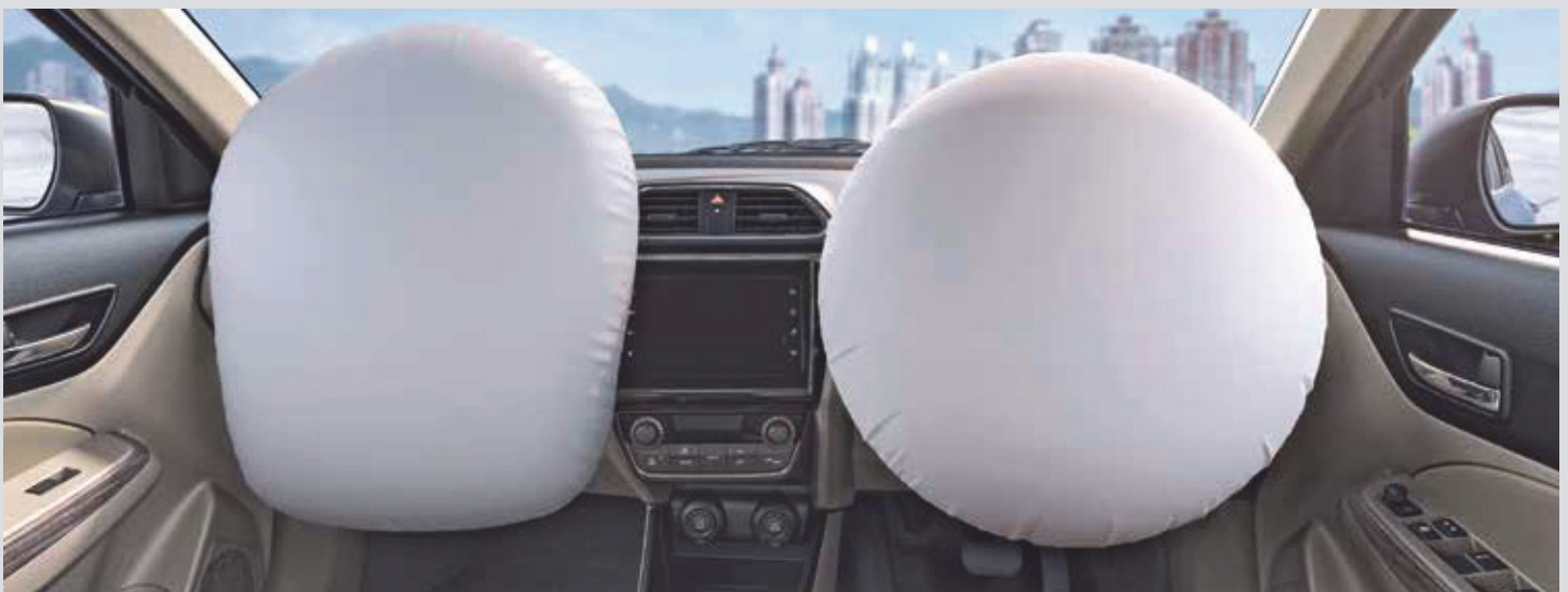
Dual Airbags That are standard across all variants