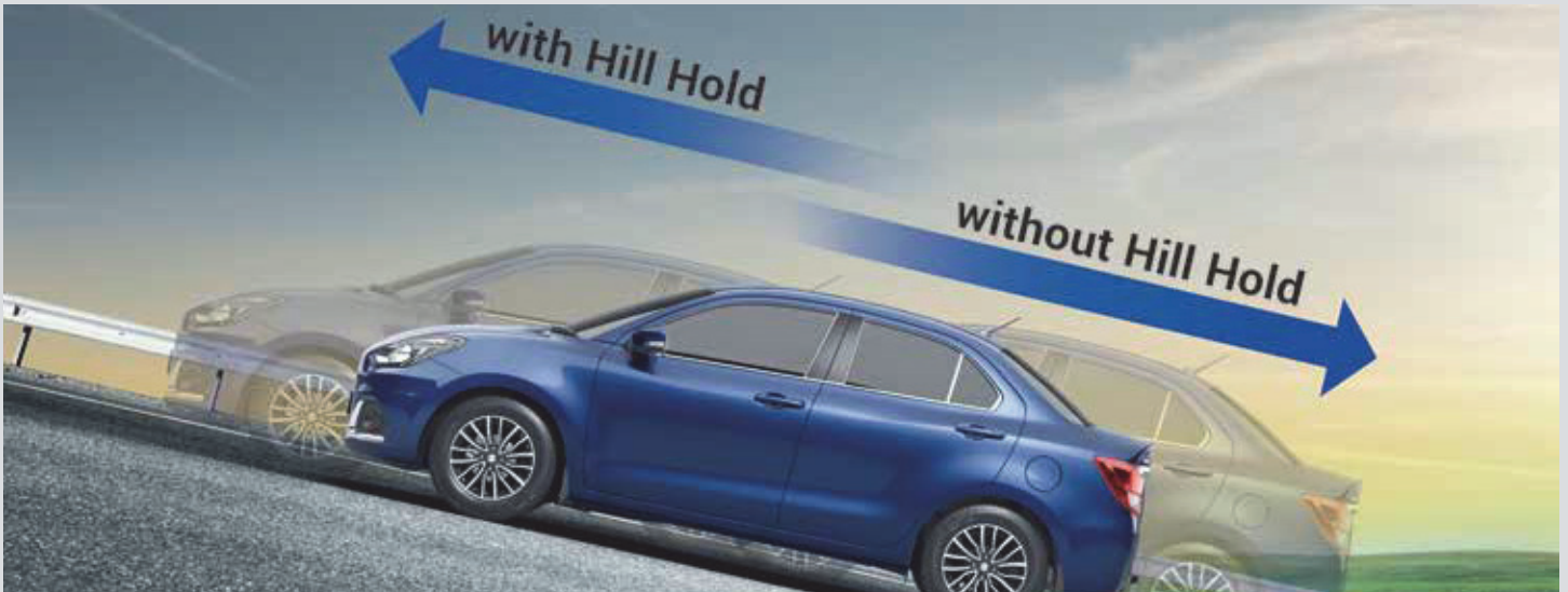
Electronic Stability Program with Hill-hold Assist* So that the drive remains smooth, even on inclined surfaces